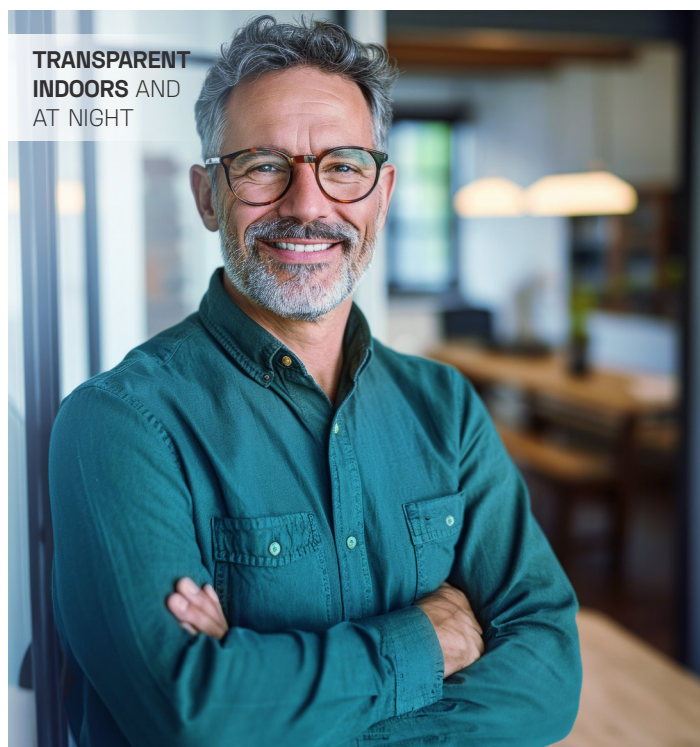
TRANSPARENT INDOORS AND AT NIGHT

Camber Technology ensures excellent optical quality at any distance , especially in near vision.